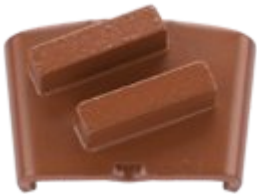
EZ C 4 Brown (Item Number: 211142)

C 2 is used for grinding on very abrasive surfaces. The segment has a long life.