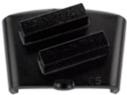
EZ C 5 Black (Item Number: 211147)

C 2 is used for grinding on very abrasive surfaces. The segment has a long life.