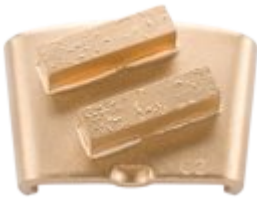
EZ C 2 Gold (Item Number: 210807)

C 2 is used for grinding on very abrasive surfaces. The segment has a long life.